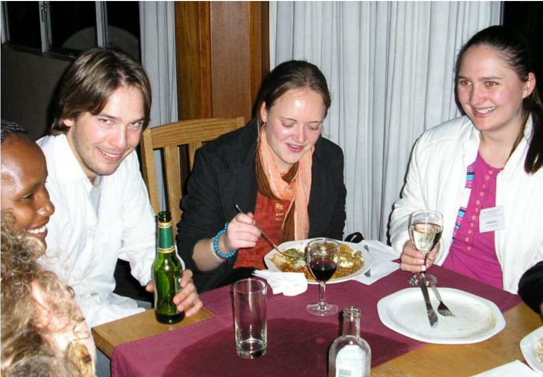
Buffet dinner on the closing night of the conference - students from UCT